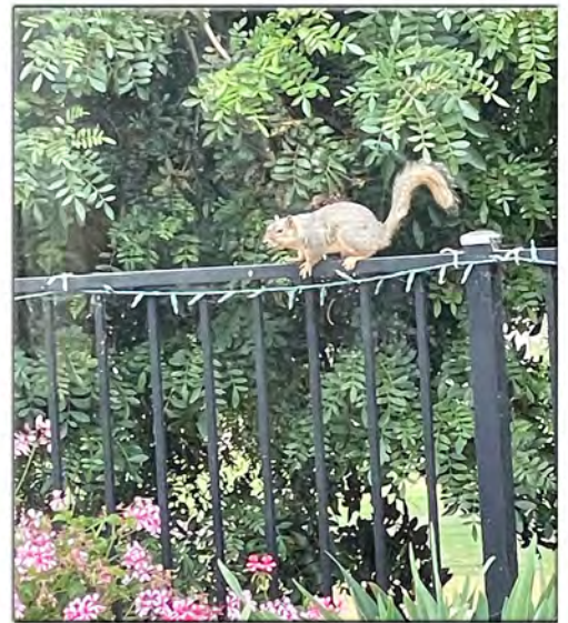
Squirrel practicing for Olympics