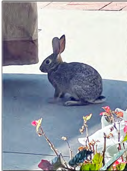
Rabbit hoping no one will notice him/her