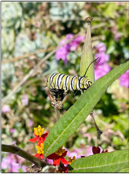
A monarch butterfly in process